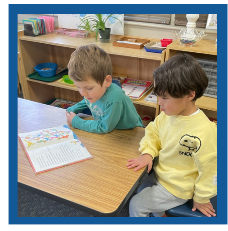
Reading to a younger friend