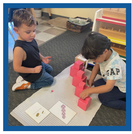
Sensorial team work