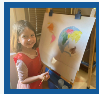
Map work as part of a cultural lesson

The picture to the right shows the results of an independent work of a second year student. The map was created by using the two dimensional puzzle map pieces and a hemisphere tracing template.