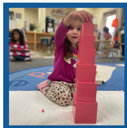
Using visual discrimination and care to build the Pink Tower