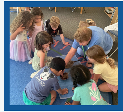
Students were comparing the parts of a large and small Horseshoe Crabs

In math, our older students are working on place value families units, tens, hundreds, and one thousand. Our pictured friend completed his work in the beginning of the school year, he was elated when he finished writing 1000.