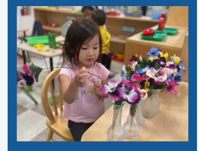
Flowers going to a child's work space