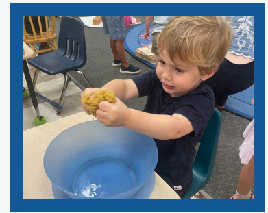
Refining hand-eye coordination - Squeezing

As these skills are mastered, we see less spillage and more self-confidence at daily snacks and lunch times. These activities help the child develop a sense of being and belonging by participating in daily life.