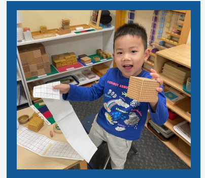
I got there!